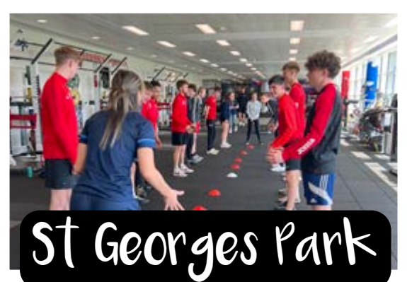
St Georges Park