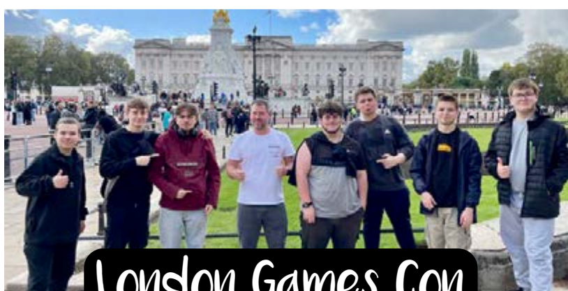
London Games Con