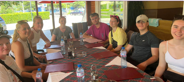
Sport and Public Services students in Bulgaria

This year, alongside trips to Italy, Spain and Slovakia , we are expanding these opportunities even further with exciting industry placements in the Caribbean, New York and British Columbia . These fully-funded trips offer our students the opportunity to develop confidence and employability skills, working alongside their peers from other countries and with students from different educational backgrounds.