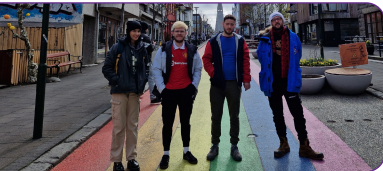
Engineering students in Iceland