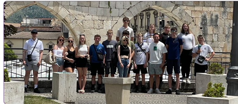
Travel & Tourism students in Italy