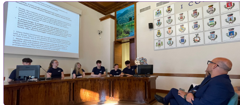
Business students in Italy

“ I have been lucky enough to take part in 2 international visits; a sports coaching trip to Alicante and a 3-week youth work placement at a camp in Slovakia. Alongside my course, the trips really helped me develop confidence, learn key skills and experience new opportunities, and I have now started a full-time job supporting students to get involved in community projects and volunteering. ”